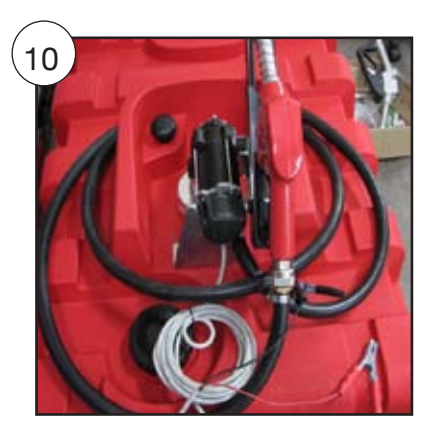
Attach manual or auto nozzle to delivery hose using the barbed hose tail and clamps provided